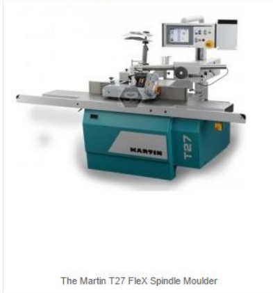
The Martin T27 Flex Spindle Moulder

The Cupboard Door Company has invested in an automated production management system, assuring deadlines are met and a smoother flow throughout the production process, and a Martin T27 Flex Spindle Moulder, to enable more efficient moulding and profiling and ensure consistent top quality. Newly-launched products include curved doors and cabinets and impermeable doors suitable for kitchen and bathroom. The office team has expanded to manage the growth in enquiries.